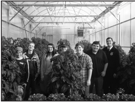
Students in the Jr/Sr Local Food Production class pose with the 75 hydroponic tomato plants and lettuce during a visit from National FFA Officer Caleb Gustin.

produce to the town's food bank along with the school's culinary arts classes, school cafeteria, and most recently a few different restaurants. As a result, new community partners have been brought on board to support the programming offered by the agriscience program.